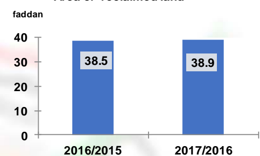
Rational distribution for reclaimed land

Area on which livestock projects were established (milk production, fattening, cattle and sheep) from reclaimed land reached to 196 feddans in 2016/2017, compared to 136 feddans in 2016/2016, an increase of 44.1% due to increased demand of companies to .establish livestock projects